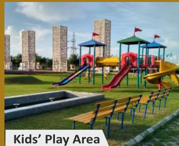
Kids' Play Area