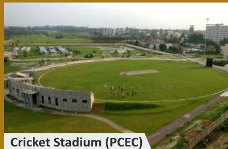
Cricket Stadium (PCEC)