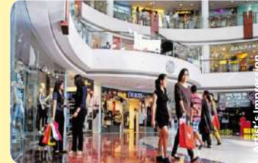
Next door shopping Complex & Malls