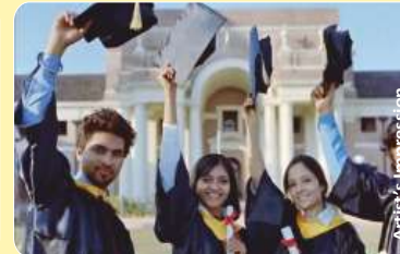
Quality National & International reputed School/Colleges