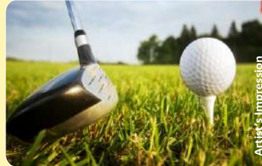
World Class Golf Course