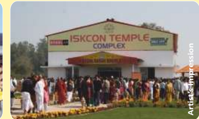
Operational spiritual centre ISKON