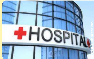
Super Speciality World Class Hospital facility