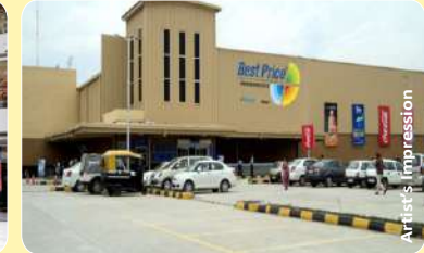
Best Price-Walmart Store Operational