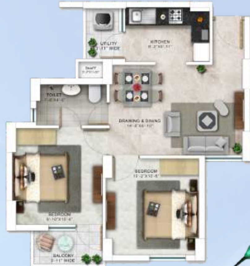
2 BHK UNIT PLAN Tower 1 & 2

Super Area : 525.00 sq.ft. (48.77 sq.mt.)