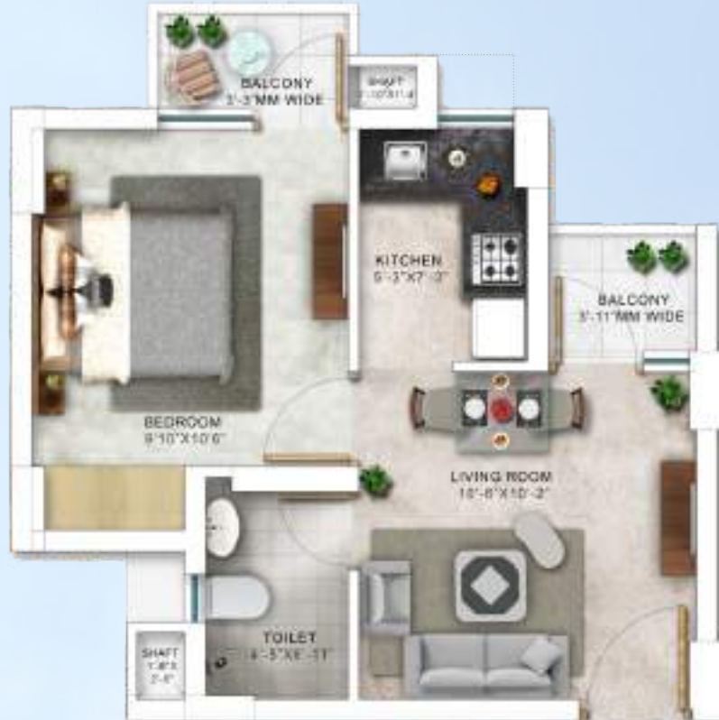
1 BHK UNIT PLAN Tower 2